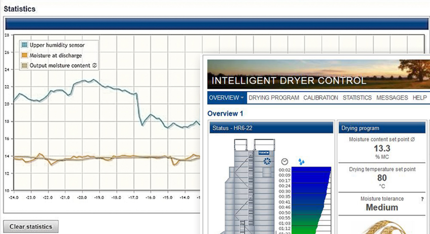
The user-friendly IDC interface serves up all the information you need – moisture content, drying time, etc.

Take full control over the drying process by studying it in detail with the advanced statistics functions of Tornum IDC – like this graph showing incoming and outgoing moisture content during the last 24 hours.